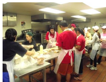
Volunteers from The Houston Junior League, MMOB and individuals make sandwiches at the Kids' Meals' kitchen.

I thank God that No More Victims referred me to Kids' Meals to help with the seven grandkids I inherited. I'm so grateful to Kids' Meals. Not only did you supply me with food and very helpful resources, you truly lifted a heavy burden from me.